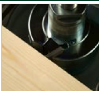
6000 rpm ensures a smooth surface finish.