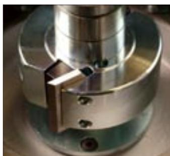
30 mm spindle axles. 10-20 minutes total mounting time.