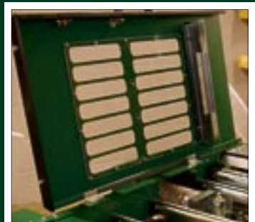
Clear windows make it easy to supervise the process.