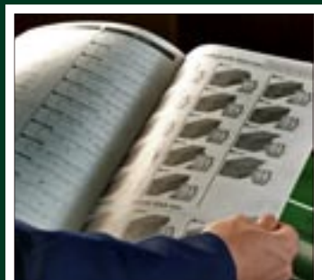
A wide range of profile knives.