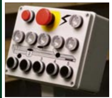
Ability to start each of the five motors separately.